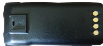
Rechargeable Battery Pack